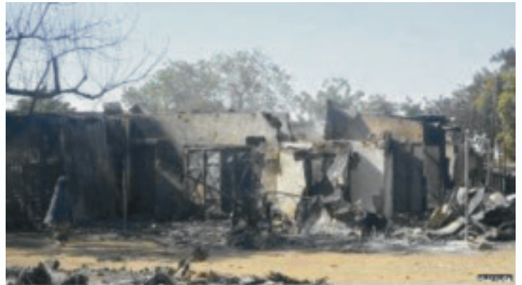
Boko Haram has been accused of numerous attacks in the north including one last month in Bama, Borno State