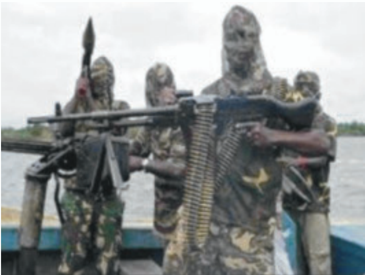
Boko Haram Fighters

Amnesty International said last month that Nigeria's army killed around 600 people after a Boko Haram attack.