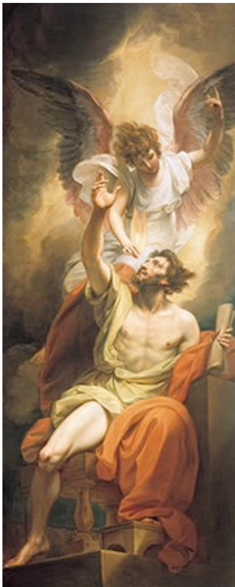
Isaiah's Lips Anointed with Fire by Benjamin West (1782, Bob Jones University Museum and Gallery)

Another advantage of the symbol laden apocalyptic genre was its ability to hide specific names behind symbols. The students of Hebrew Scripture could readily understand what was being referred to, for in-