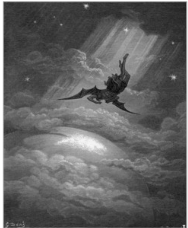
Paul Gustave Doré’s (1832–1883) depiction of the fall of Lucifer.

Then, suddenly, the dreaded prophecy of The One coming from the seed of Eve (a human) invaded earth. The stately and mighty Gabriel, the angel of The Presence, came to Mary announcing the Promised One would be born to her. The fulfillment of Genesis 3:15—the seed of Eve coming to crush the