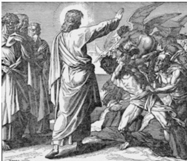
Jesus casts out the devil by by Julius Schnorr von Carolsfeld (1794-1872)