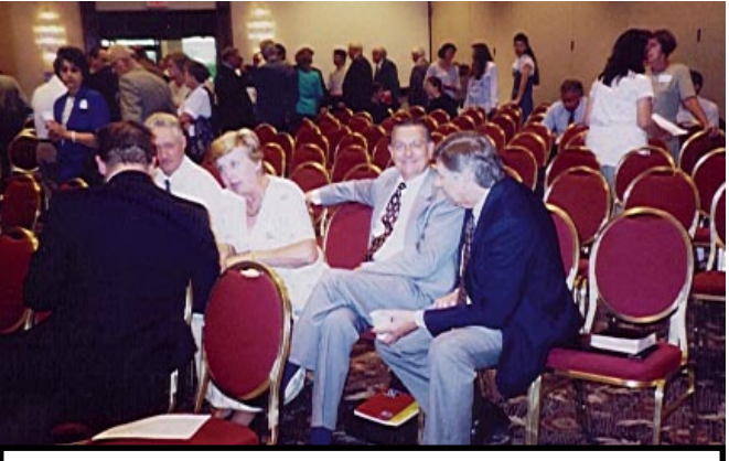
Break-time at the Conference—just a few of those in attendance!