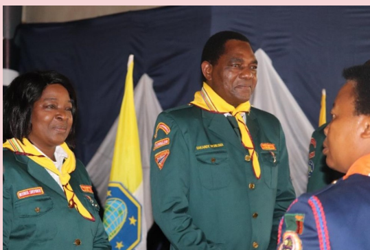
Zambian President Hichilema and Wife, in Sabbath Youth Leader uniforms.

His journey to the presidency has not been an easy one and has been wrought with much persecution and attack. After losing in 6 previous elections, he was arrested in 2017, when police broke into his home under the orders of the political opposition incumbent president. He was charged with treason after a minor traffic offense.