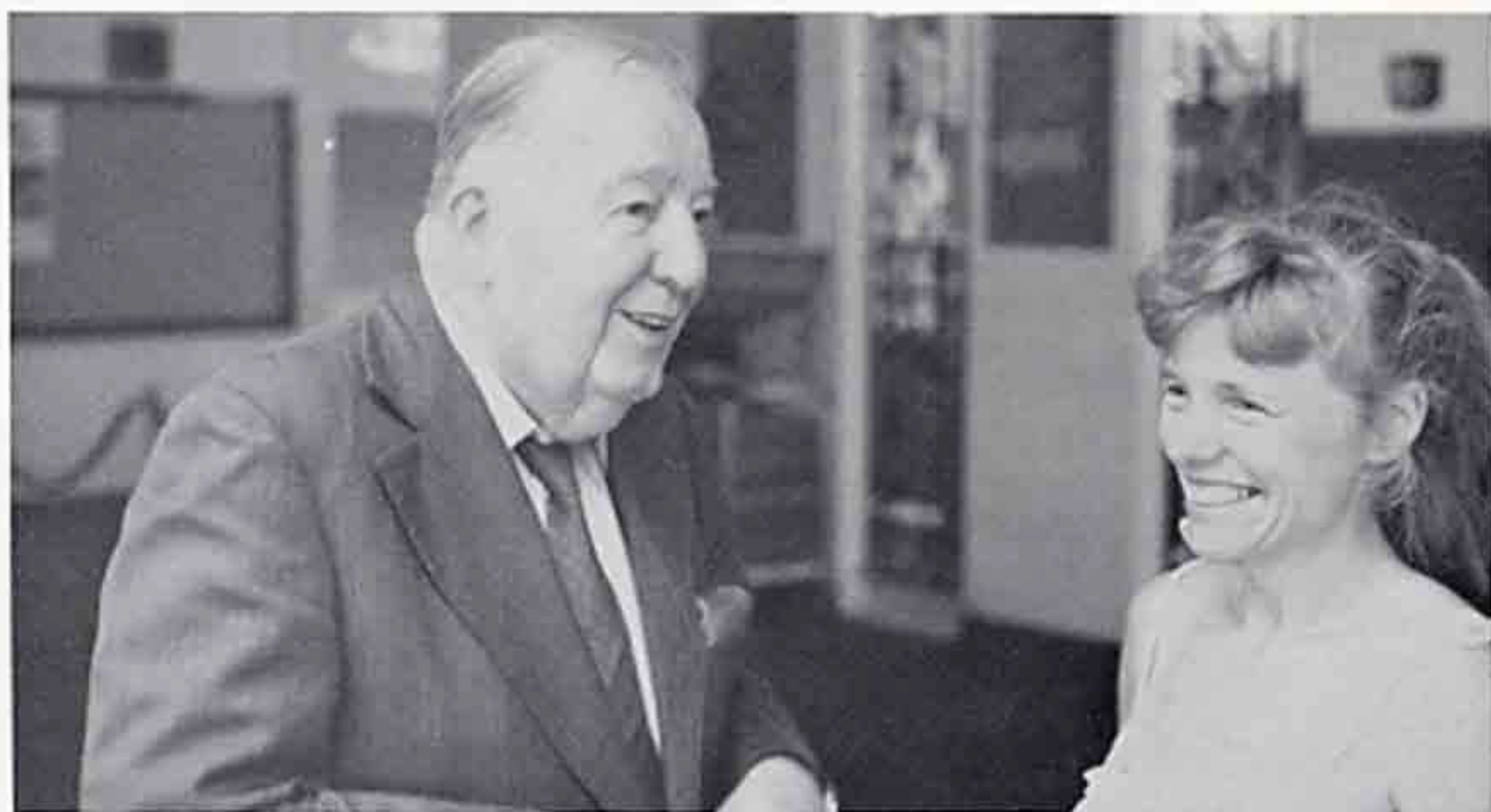
The honorable Jennings Randolph, retired senator from West Virginia, chats with the editor's